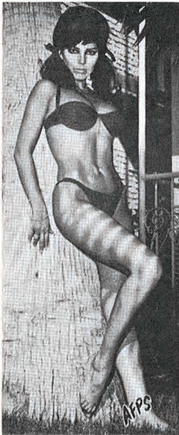
DESERT FLOWER — Dark-eyed Patty Duke is one of the lovely "desert flowers" found in the warm sun of Las Vegas.